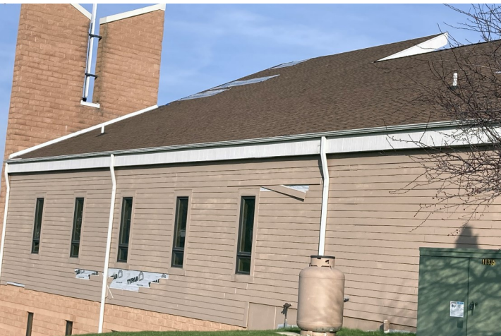
Minor damage was done to the roof and south side of Faith's building and shed from EF-2 tornado that hit the north side of Kewanee on March 31, 2023.

Lord , in Your mercy, hear our prayer. O Lord, heavenly Father, we gratefully remember the sufferings and death of Your dear Son, Jesus Christ, for our salvation. Rejoicing in His victorious resurrection from the dead, we draw strength from His ascension before You, where He ever stands for us as our own High Priest. Amen