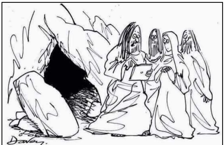
"He's not in there! Oh, wait - he's changed his status to 'risen' "

Answers: 1. False, he was a gentile, probably a Greek 2.True, Paul refers to him as a physician. 3.True, Luke was a travel companion on some of Paul's journeys. 4.False, There is no Biblical indication that Luke ever met Jesus himself. 5.True, Luke is credited as the author of "Acts", and only gentile author in the Bible.