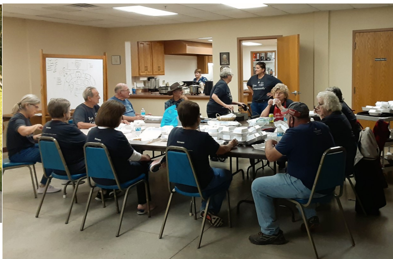
Volunteers enjoy their dinners and rest after a long successful day